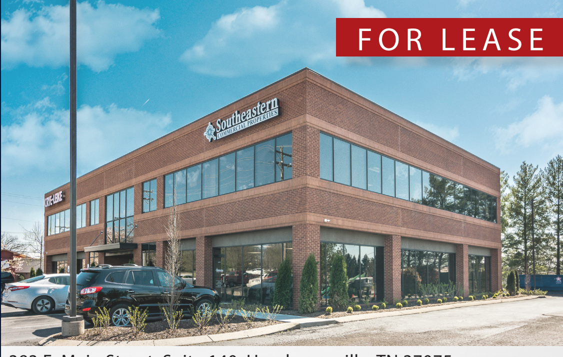
383 E. Main Street, Suite 140, Hendersonville, TN 37075

Available Space: 1,569 sf Lease Rate: $24/SF MG