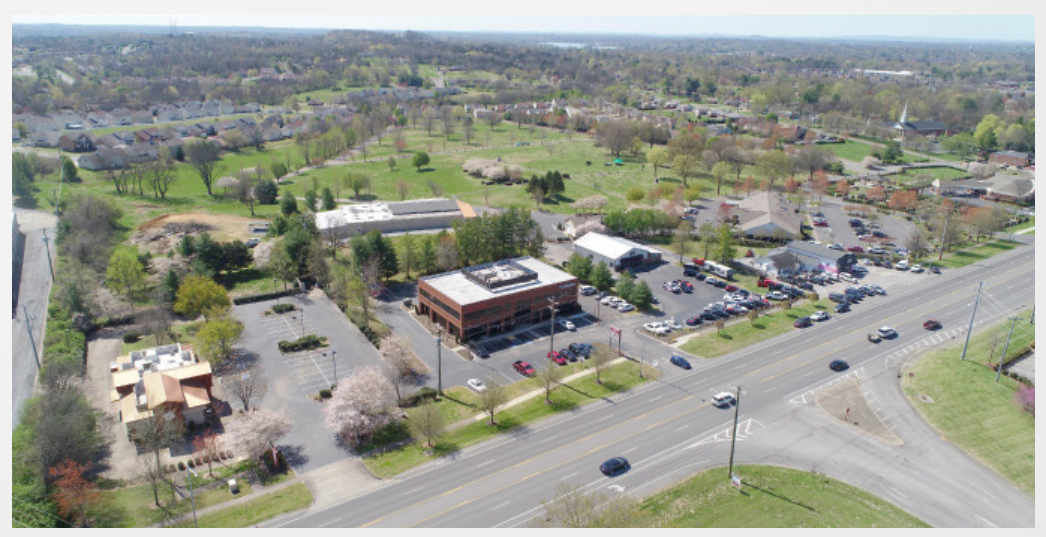
*The information contained herein has been given to us by the owner of the property or other sources we deem reliable. We have no reason to doubt its accuracy, but we do not guarantee it. All Information should be verified prior to purchase or lease.