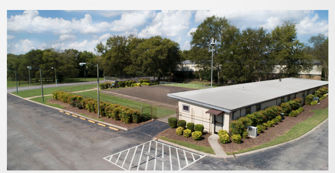
*The information contained herein has been given to us by the owner of the property or other sources we deem reliable. We have no reason to doubt its accuracy, but we do not quarantee it. All Information should be verified prior to purchase or lease.