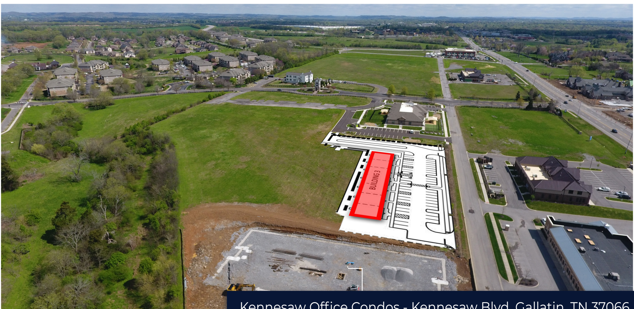
Kennesaw Office Condos - Kennesaw Blvd, Gallatin, TN 37066