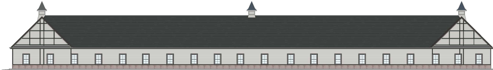
REAR ELEVATION SCALE: 1/8" = 1'-0"