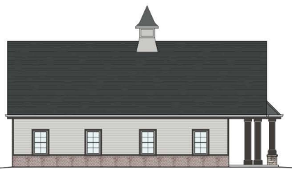
LEFT SIDE ELEVATION SCALE: 1/8" = 1'-0"