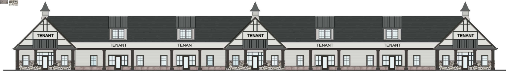
FRONT ELEVATION SCALE: 1/8" = 1'-0"